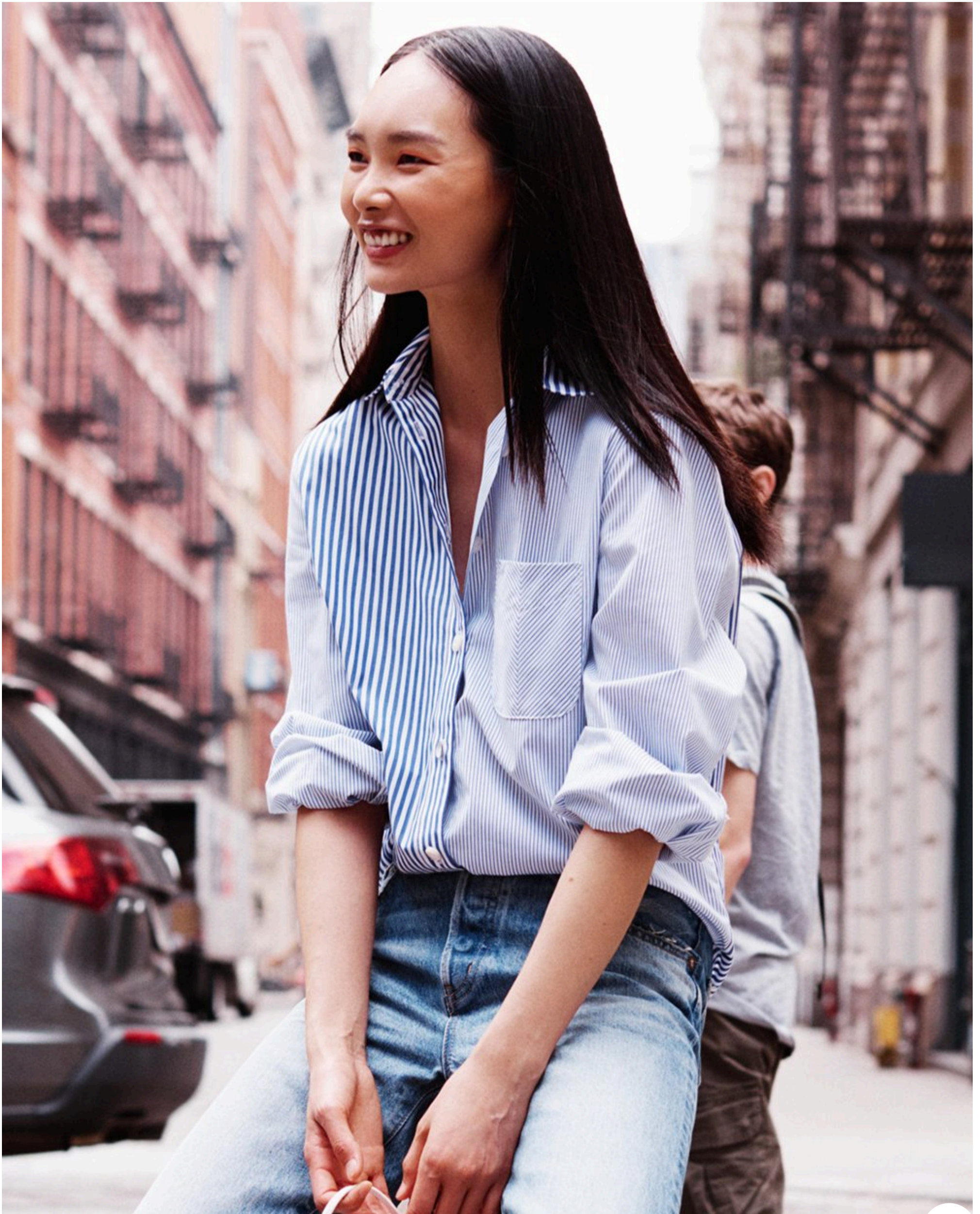
rag & bone, Moussy Vintage

Having an assortment of classic T-shirts in your closet is a no-brainer, but you'll also want to have a few elevated options to rotate through as well. You can't go wrong with a collared shirt, as it has just the right amount of polish your everyday wardrobe needs. The best part is that collars can be found on just about any shirt style, even sweaters for the colder winter months. Choose between a few different styles of polo shirts to add a bit of refinement to your uniform style. They can be worn with tailored pants, your favorite types of jeans and even maxi skirts.